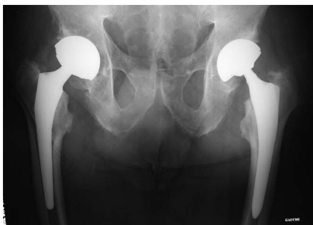
Figure 2 Bilateral arthroplasty with a dual mobility press-fit cup: on the right, stem with Morse taper 12–14; to the left, stem with Morse taper 8–10 (not part of this series).