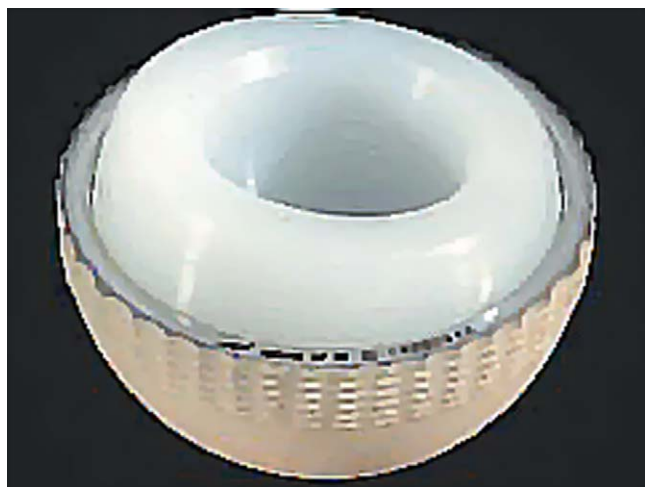
Figure 1 Dual mobility cementless press-fit cup (Novae Sunfit™, Serf, Décines, France).

The dual mobility series included 105 patients who underwent surgery by the same surgeon (DS) between January